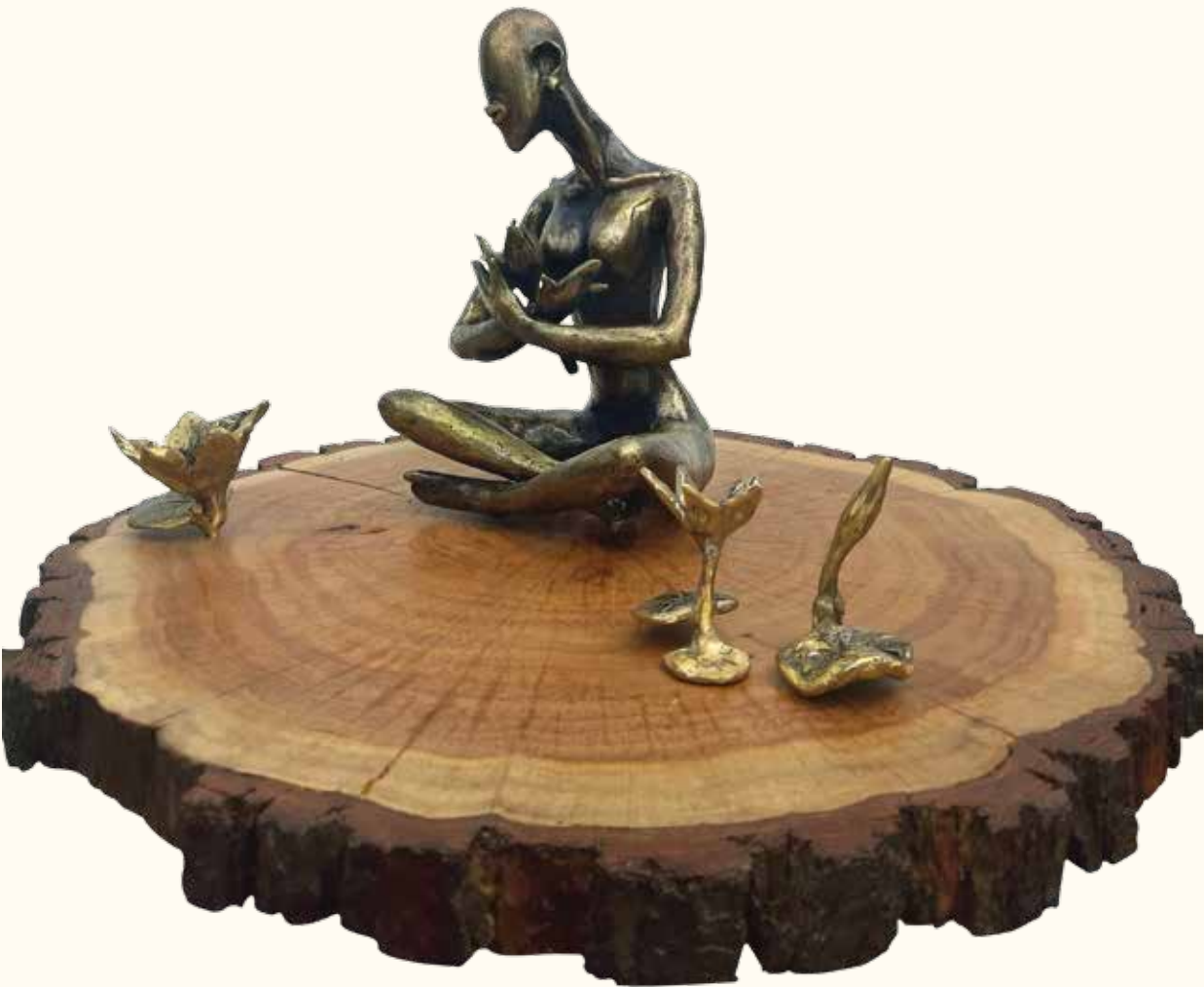
All Mine | 12" x 20" x 21" | Bronze on Wood