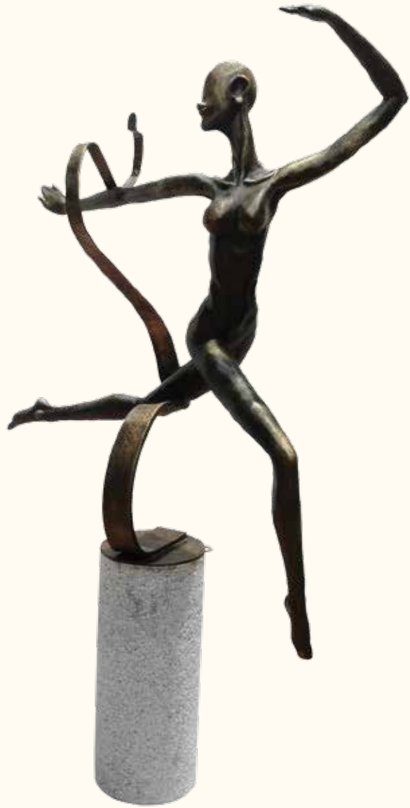
Twirl | 56" x 34" x 16" | Bronze and Granite