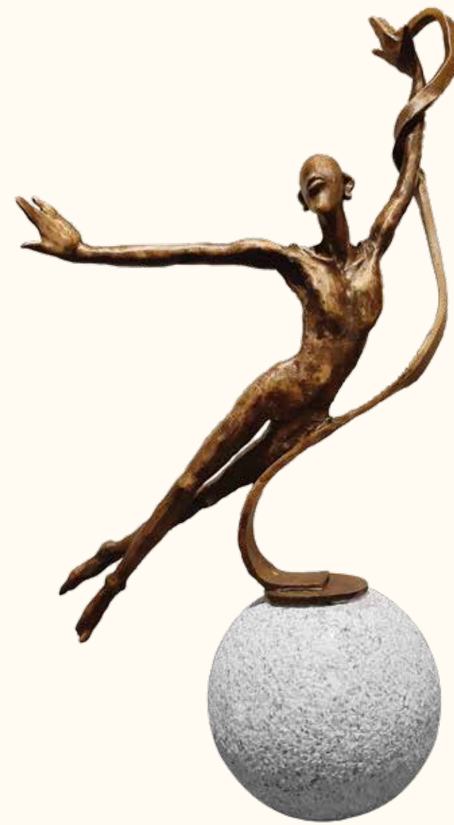
Flying | 28" x 16" x 8"