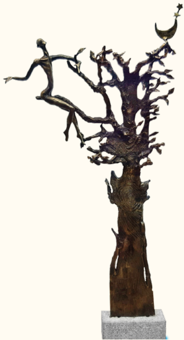
Garden Dweller 2 | 51" X 25" X 9" | Bronze on Granite