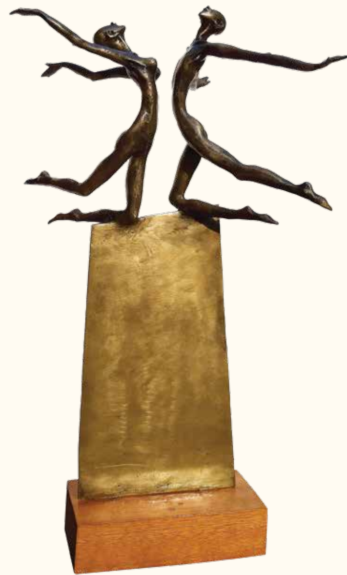
Solo for Two | 25" x 14" x 11" | Bronze on Wood