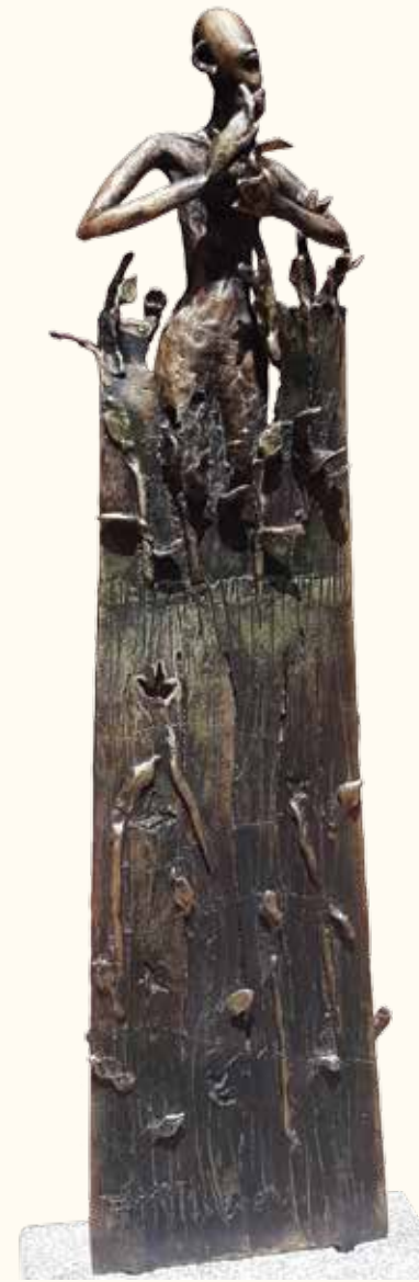
Garden Dweller | 35" x 12" | Bronze on Granite