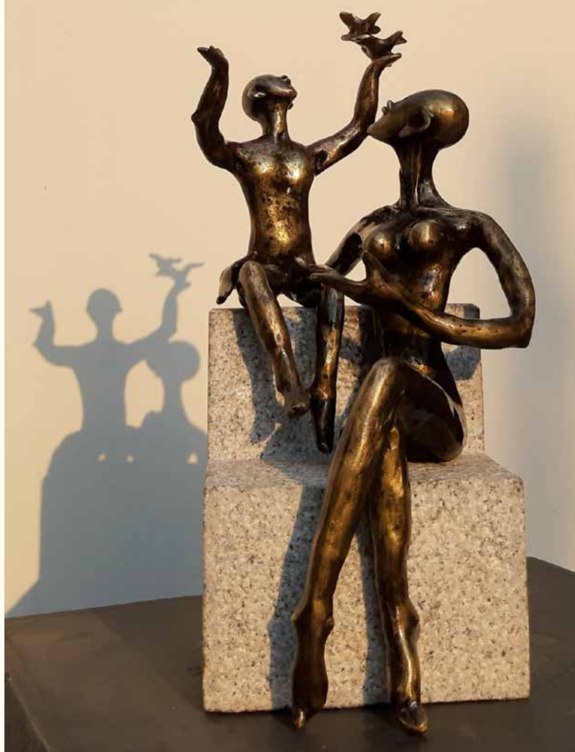
Wishing on a Bird II 14" x 6" x 6" Bronze and Granite