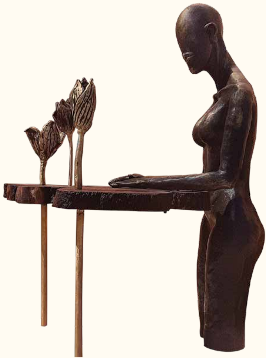
Flowers Across My Table | 40" x 25" x 32" | Bronze and Wood