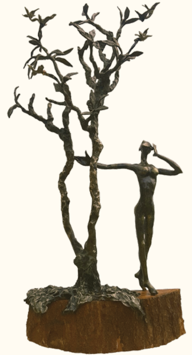
God's Voice | 38" x 21" x 12" | Bronze on Wood