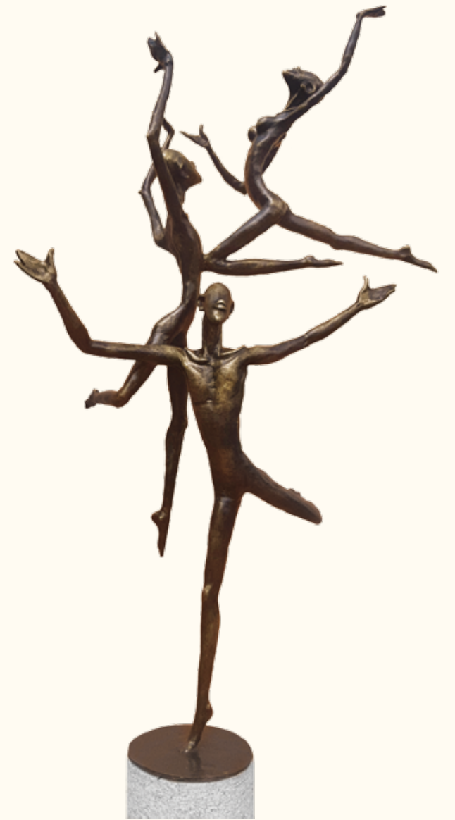
Light Catchers | 79" x 50" x 29" | Bronze on Granite