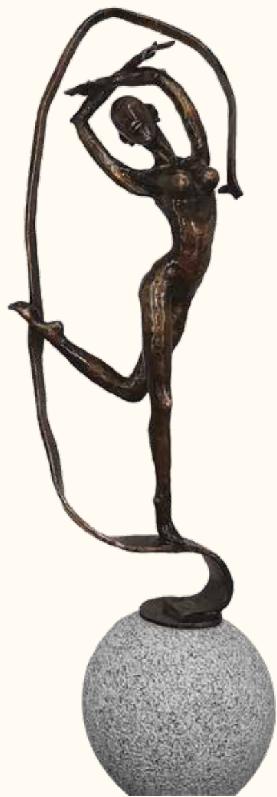
Dancer | 32" x 14" x 8" | Bronze on Granite