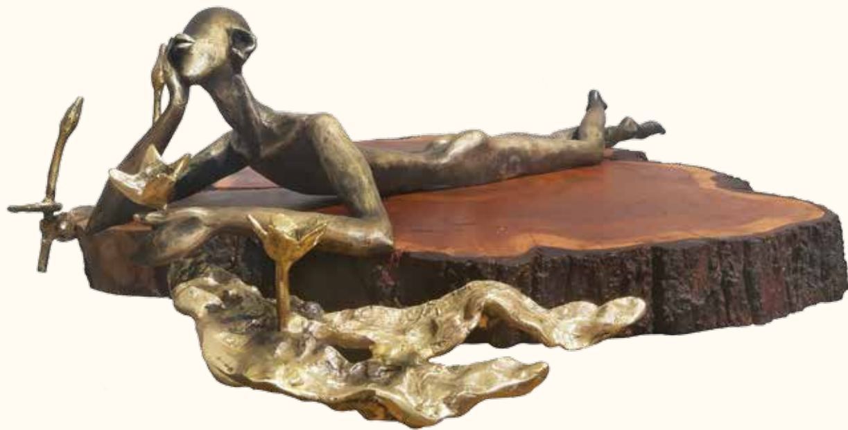
Dreamer | 23" x 28" | Bronze on Wood