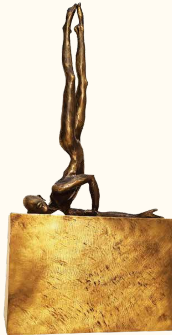
This Side Up | 36" x 13" x 5" | Bronze on Bronze