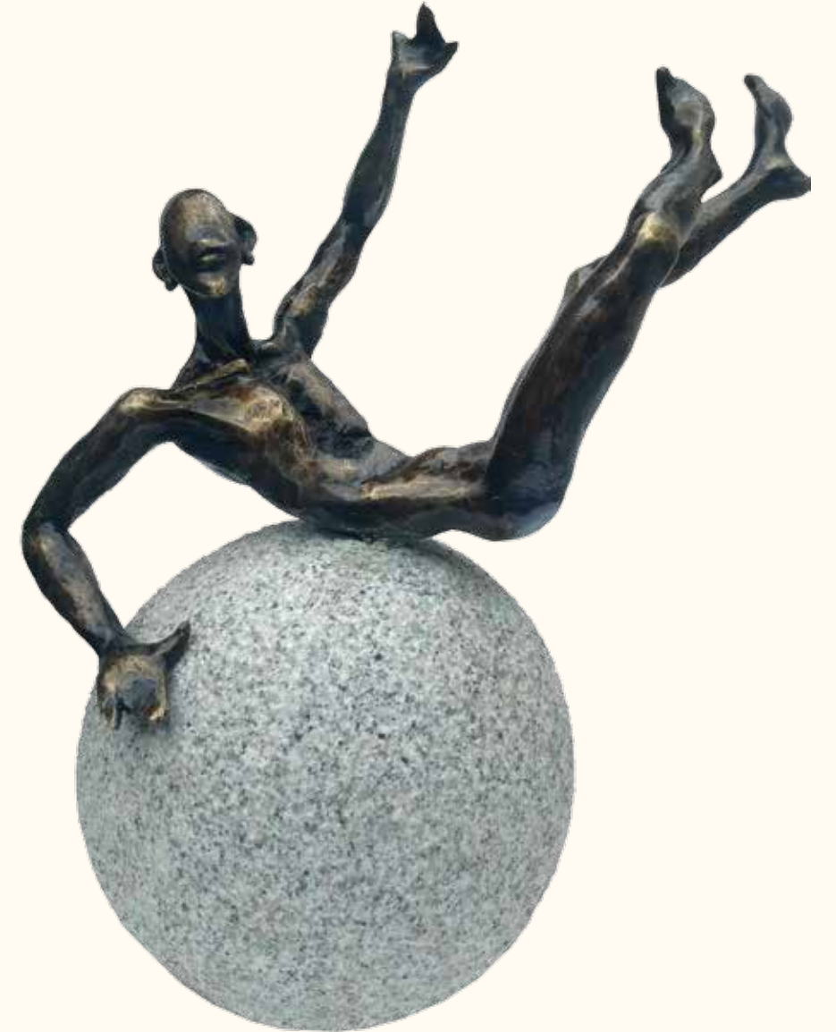
Still on the Ball | 14" x 12" x 6" | Bronze on Granite