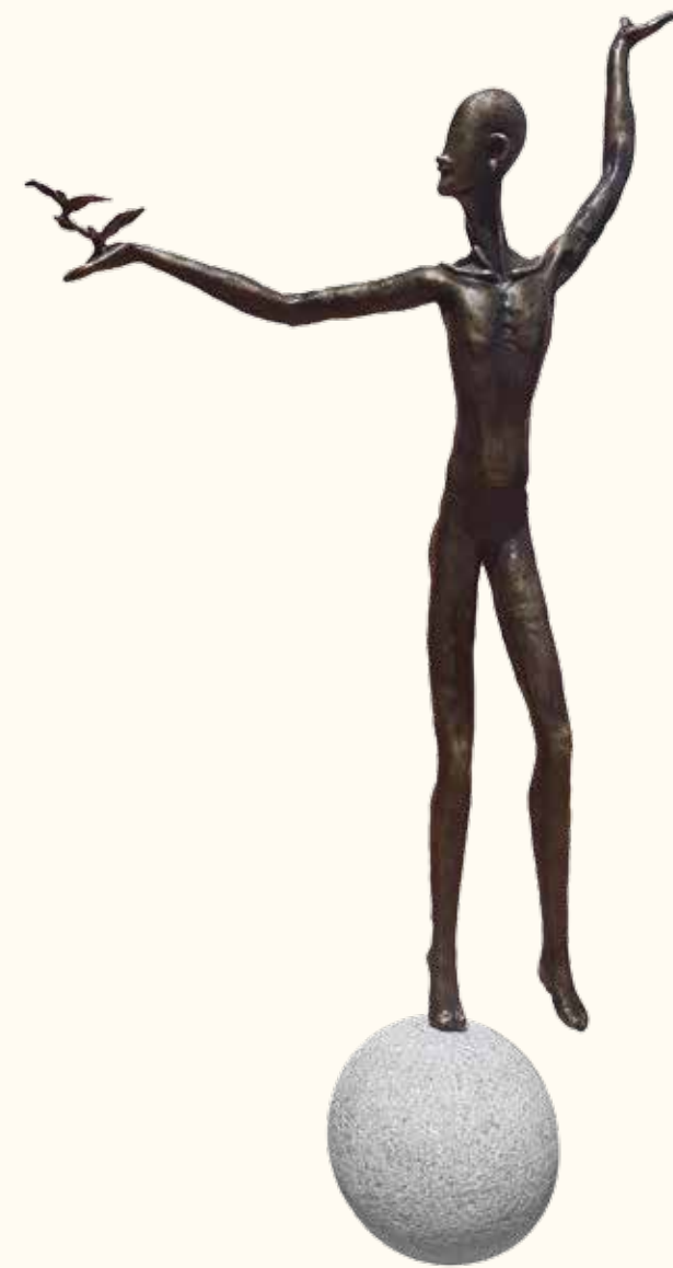
Wishing on a Bird | 67" x 37" x 14" | Bronze On Granite