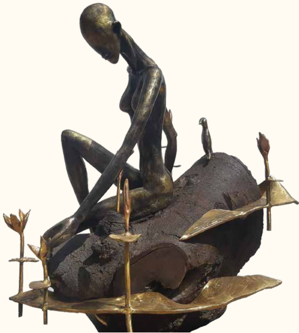
Lotus Pond | 28" x 22" x 32" | Bronze and Wood