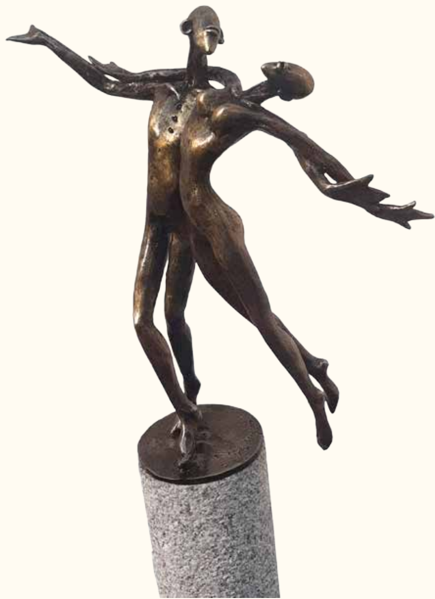
Solo for Two ..Dancers | 22" x 12" x 6" | Bronze on Granite