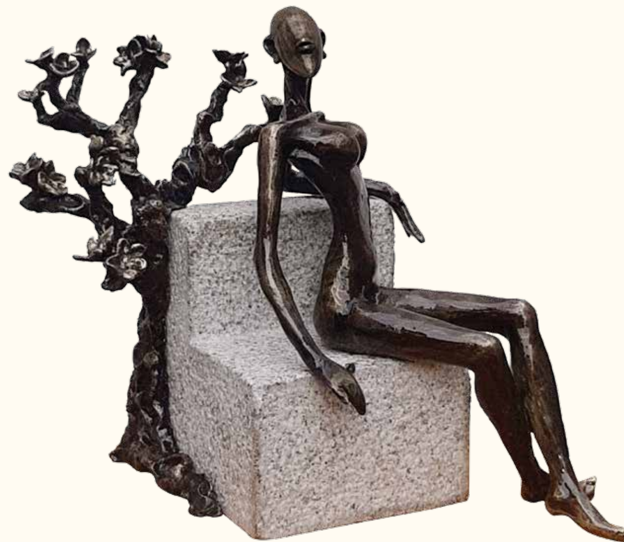
Frangipani | 12" x 13" x 10" | Bronze and Granite