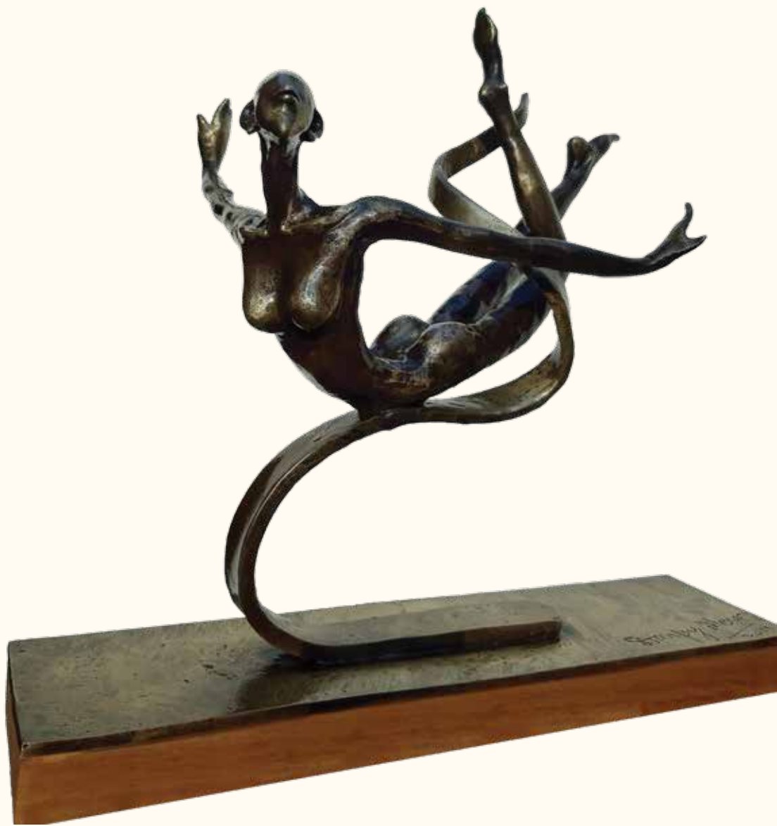
Floating | 16" x 16" x 12" | Bronze on Wood