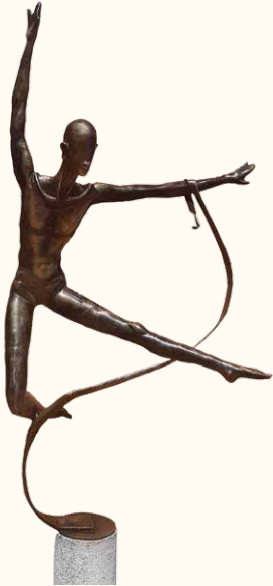
Jump | 76" x 32" x 16" | Bronze on Granite