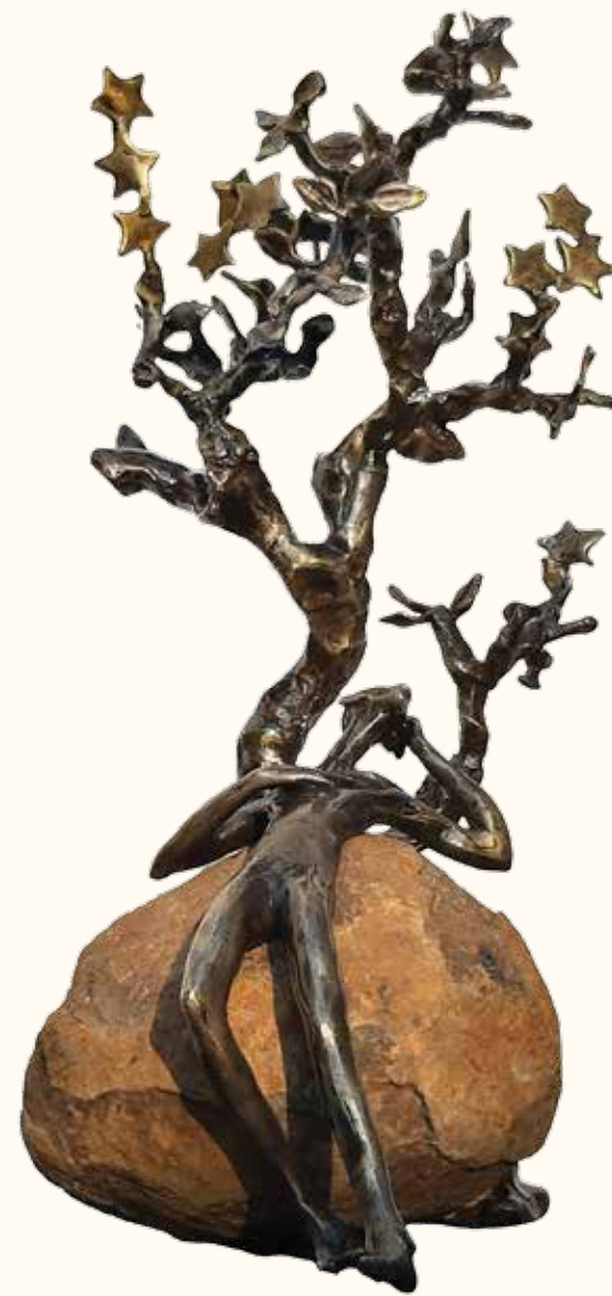
Through The Leaves to The Stars | 18" x 12" x 12" | Bronze on Boulder