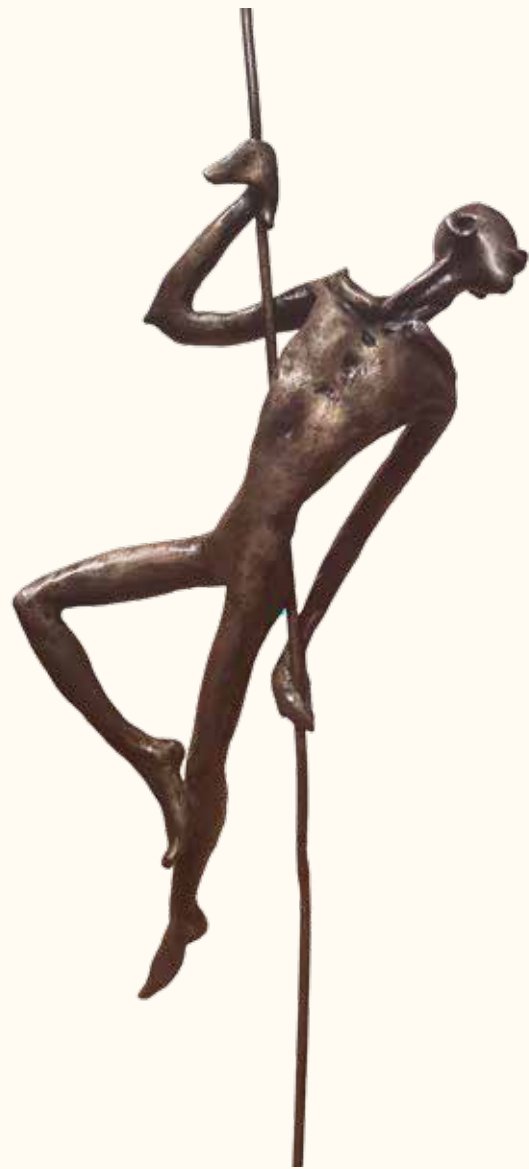
Mobile 2 | 71" x 19" | Bronze on bronze rod