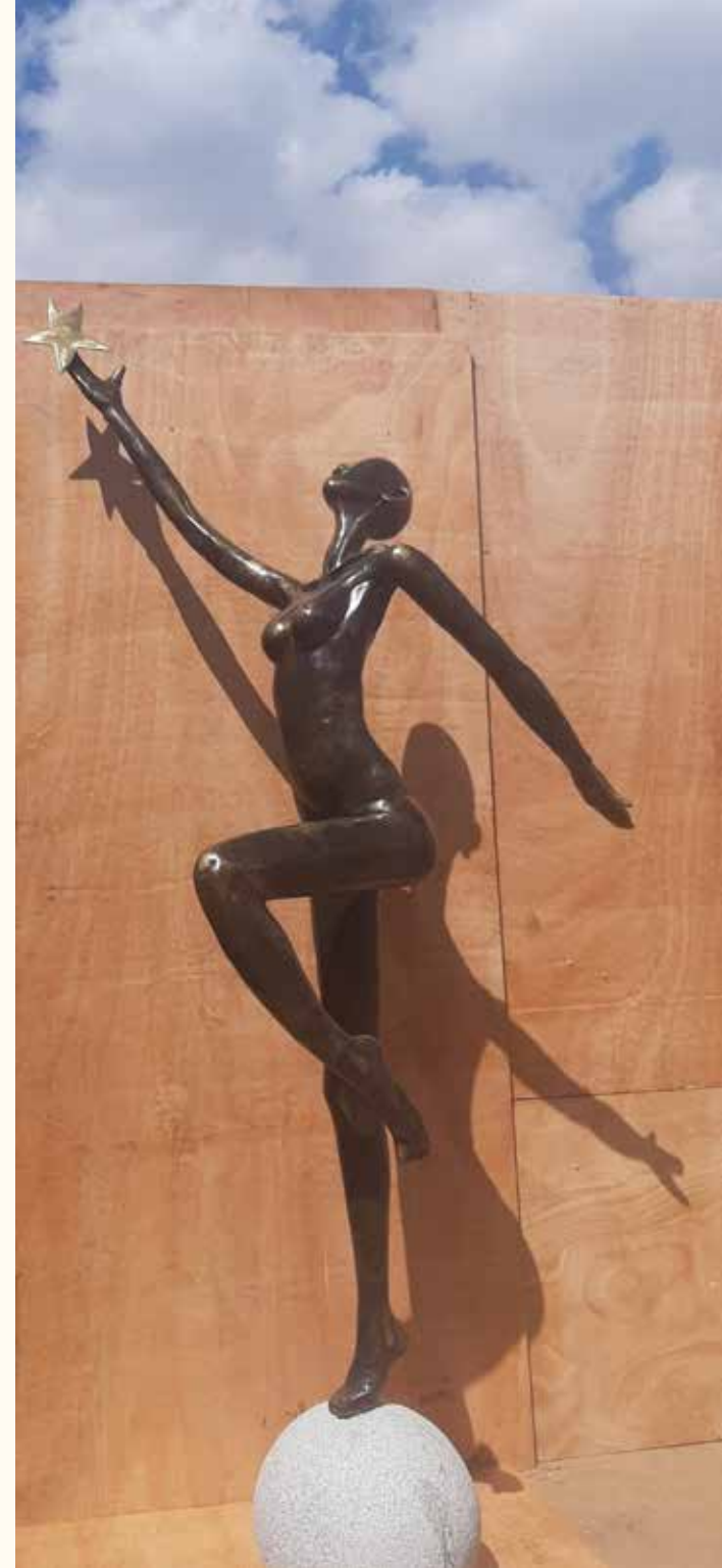
To The Light | 96" x 46" x 23" | Bronze on Granite