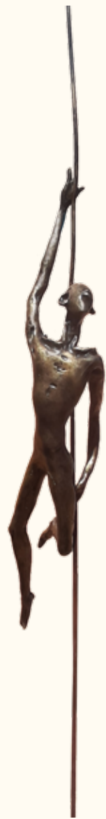
Mobile | 90" x 24" | Bronze on bronze rod