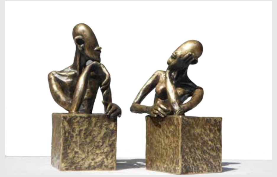
I Am Listening Male: 14" x 8" x 7" Female: 12" x 8" x 6" Bronze