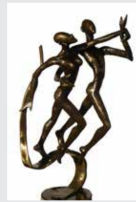
On The Same Crest 35" x 12" x 12" Bronze on Granite