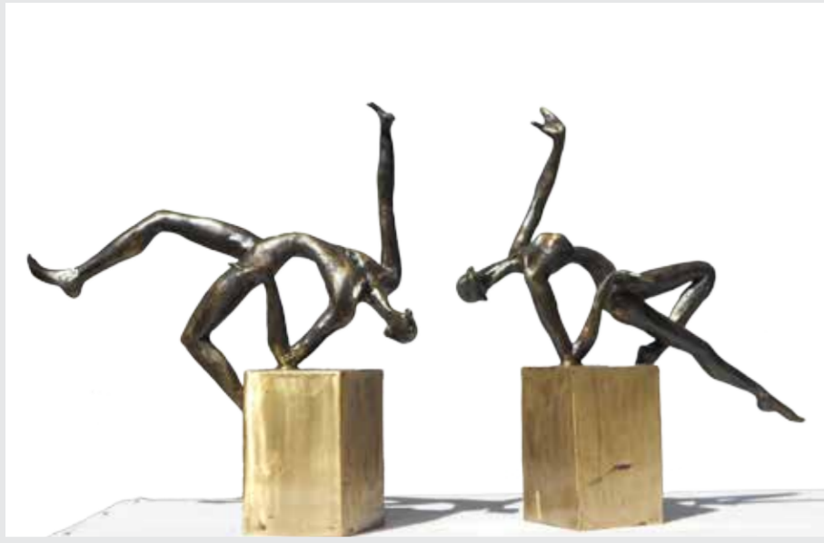
Double Act Male: 17" x 16" x 6" Female: 17" x 17" x 6" Bronze