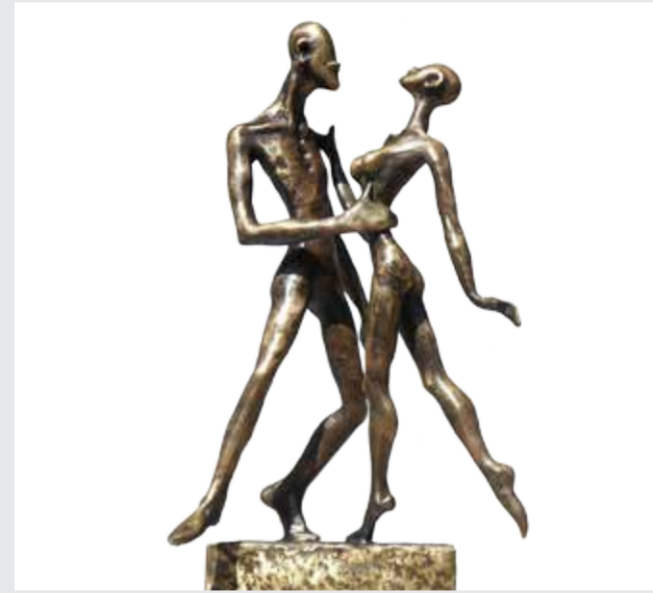
Effortless Unity 27" x 12" x 9" Bronze