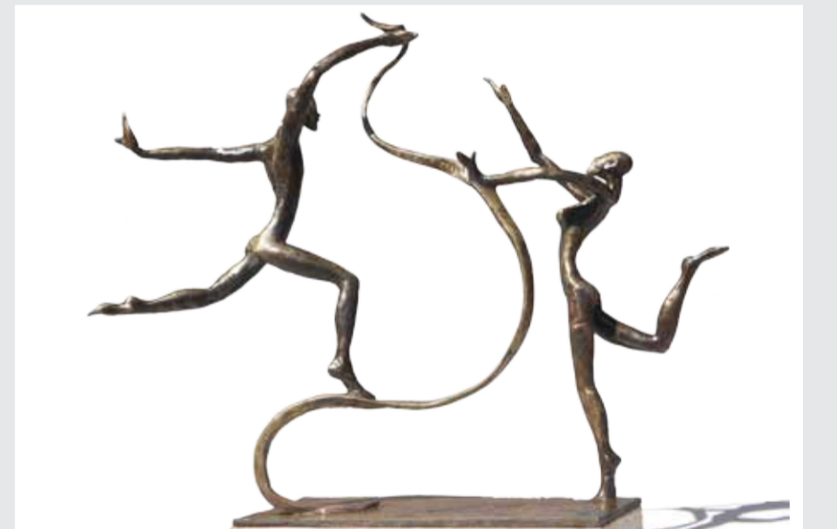
Heaven and Earth 19" x 24" x 9" Bronze