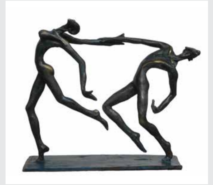
In Rhythm 14" x 14" x 7" Bronze on Granite