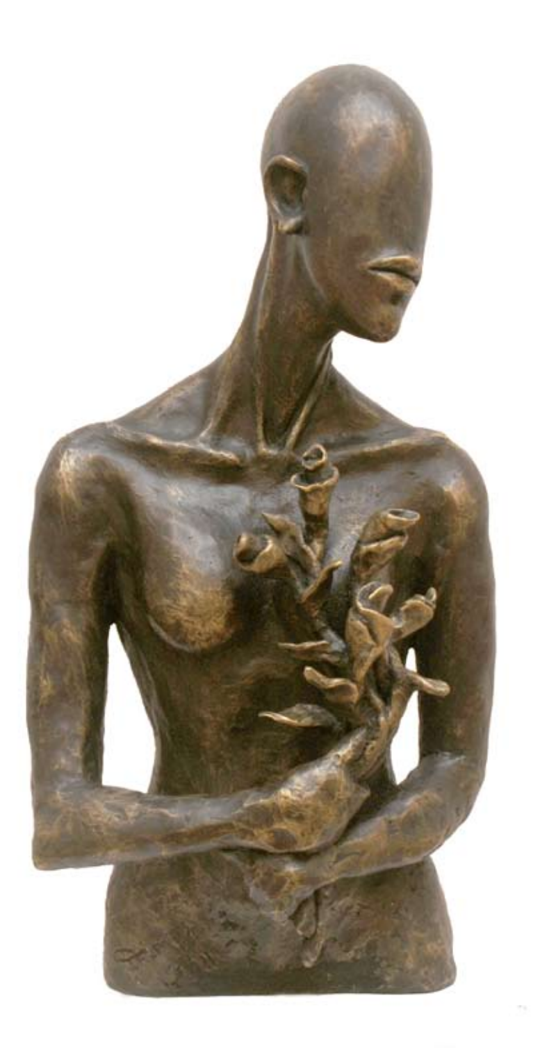
Woman with Flowers 22.25 x 11.5 Inches Bronze 2011