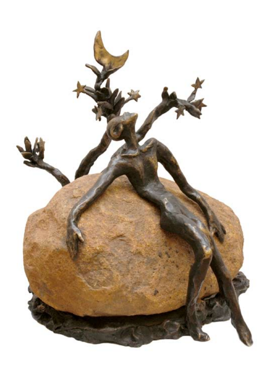
The Moon, The Stars & I, 15 x 15.5 Inches, Bronze & Stone Base, 2011