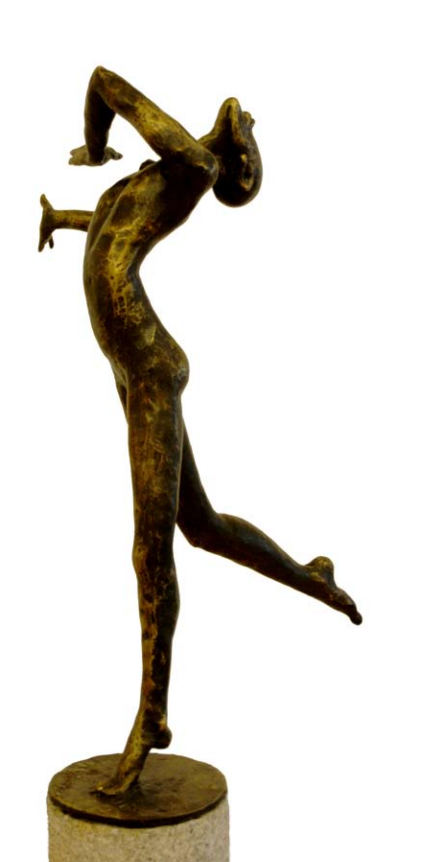
Heavenly 26.25 x 16.5 Inches Bronze & cylindrical Granite Base 2011