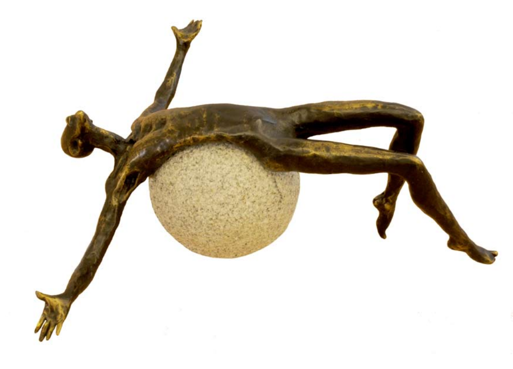
On The Ball 19.5 x 6 Inches Bronze & circular Granite Base 2011