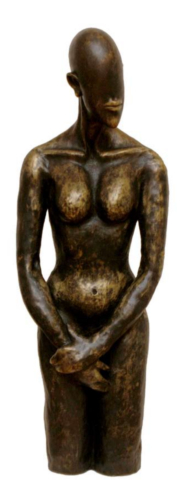
Torso 40 x 13.5 Inches Bronze 2011