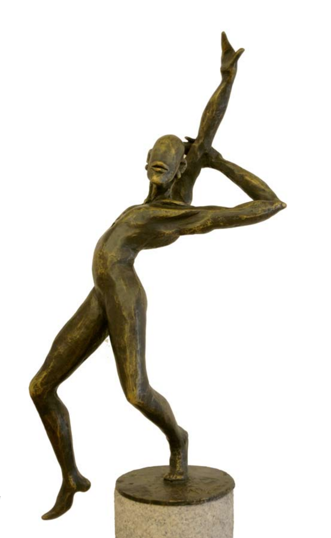
Take Off-2 24.5 x 12.5 Inches Bronze & cylindrical Granite Base 2010