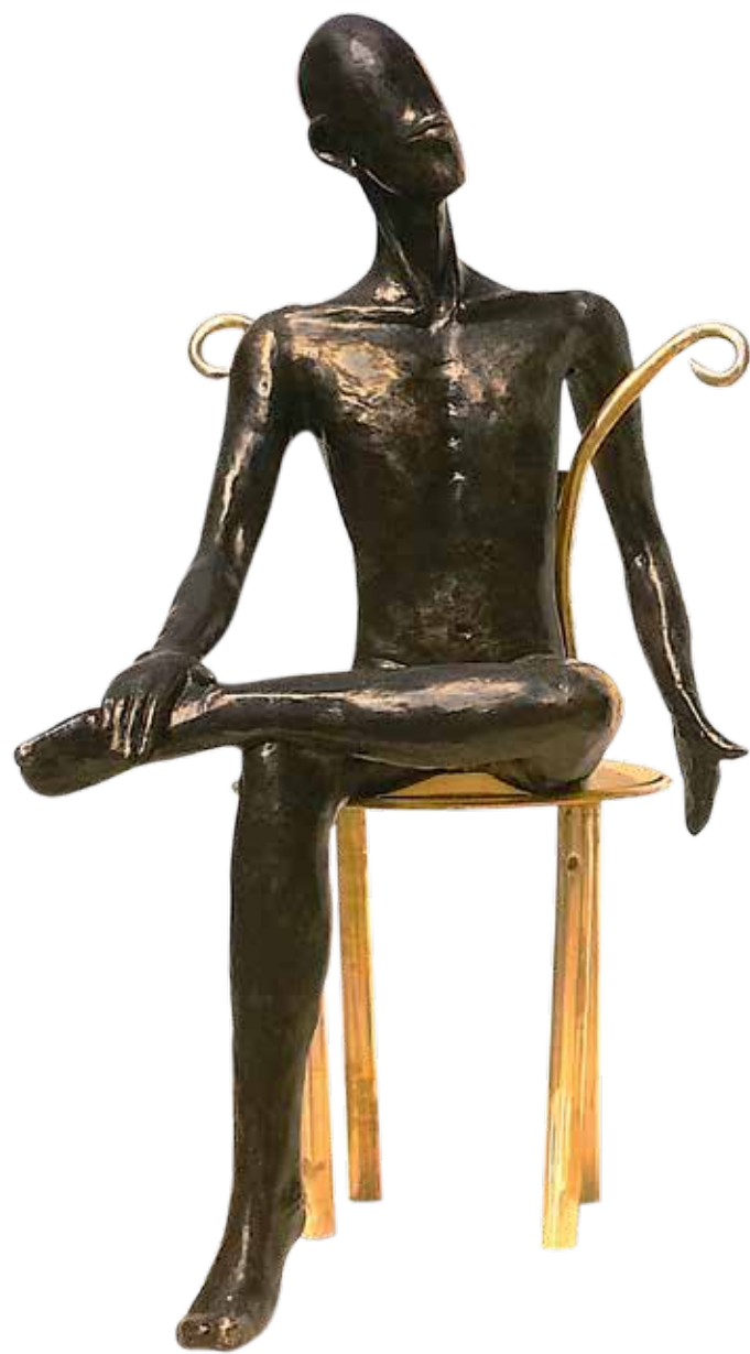
Seated Figure (Man) | 44" x 28" x 24" | bronze