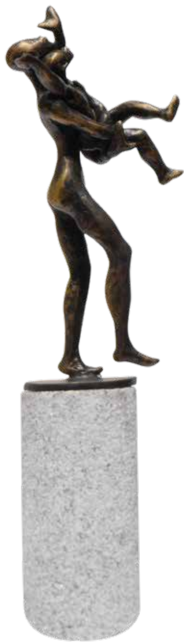
Mother and Child | 26" x 10" x 4" | bronze on granite