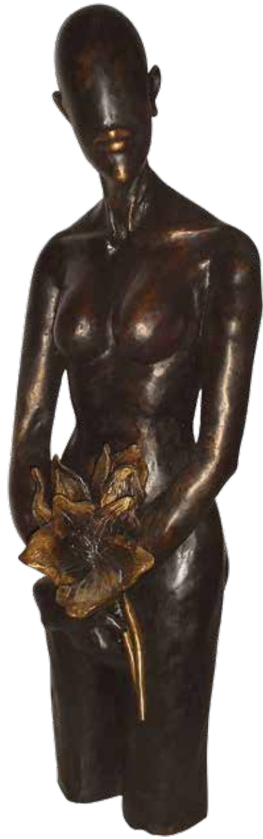
Torso with Flowers | 41" height | bronze