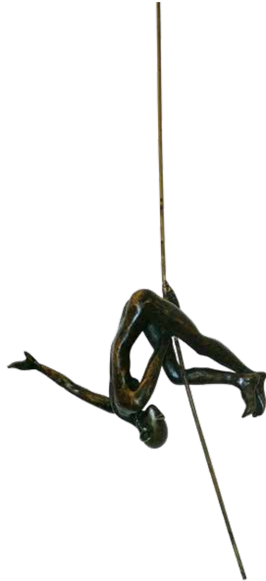
Mobiles (hanging) | rod 41" figure 9" | bronze