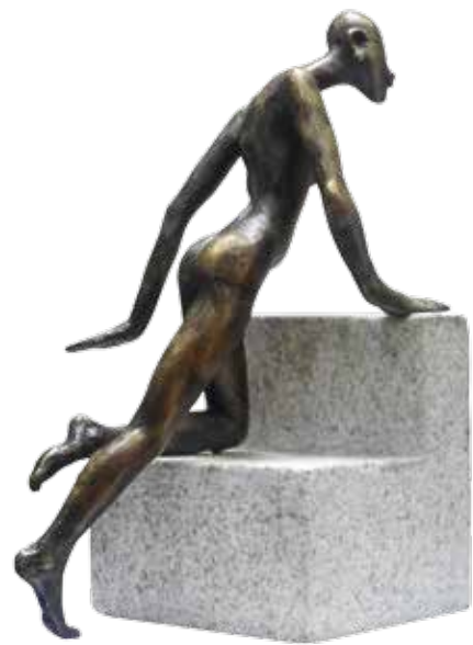
Leaning | 15" x 9" x 11" | bronze on granite