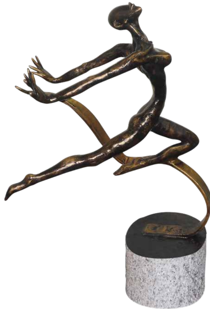
Freedom | 31" x 15" x 7" | bronze on granite