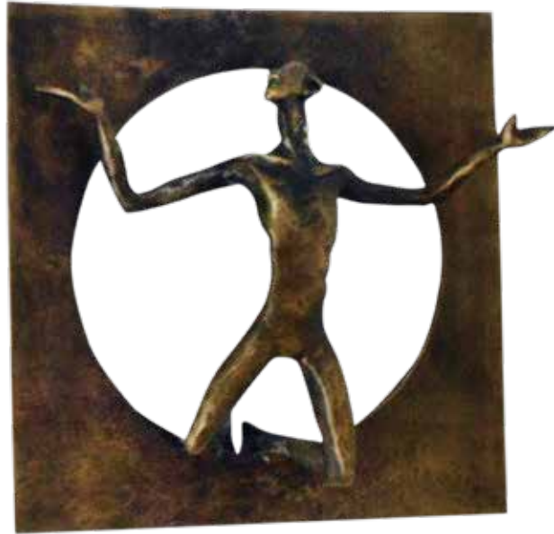
Dancers | 15" x 15" each | bronze