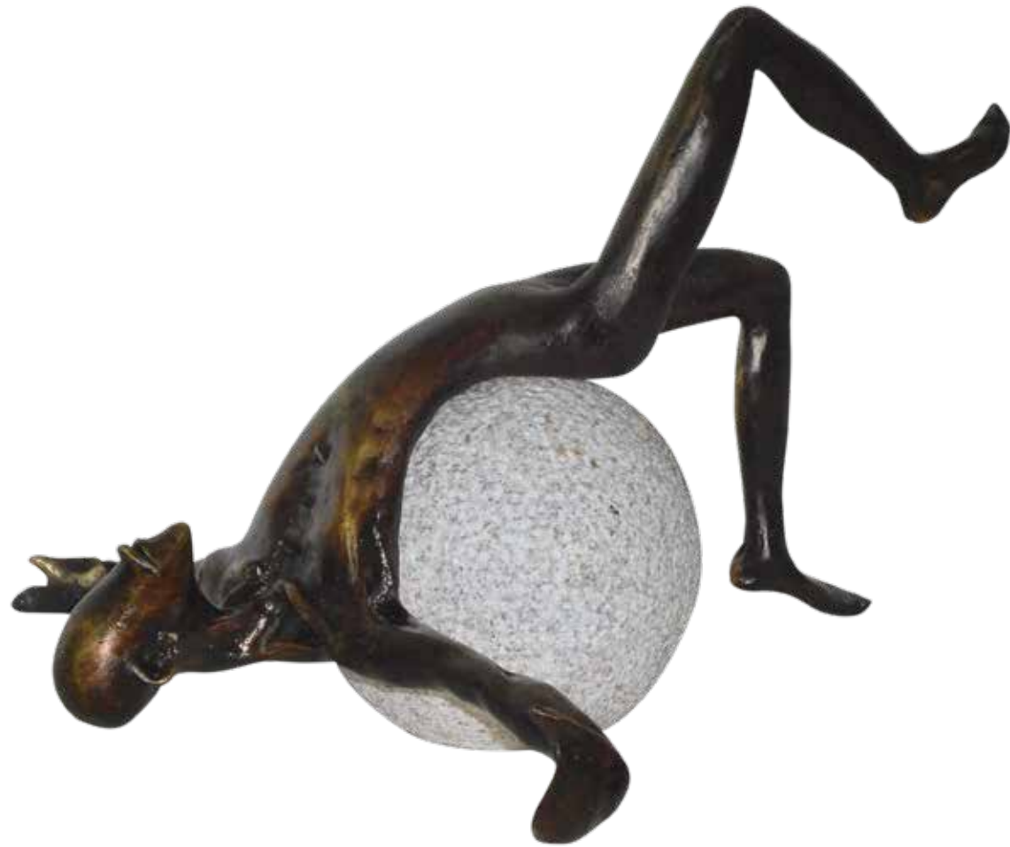
On the Ball | 18" x 18" x 11" | bronze on granite