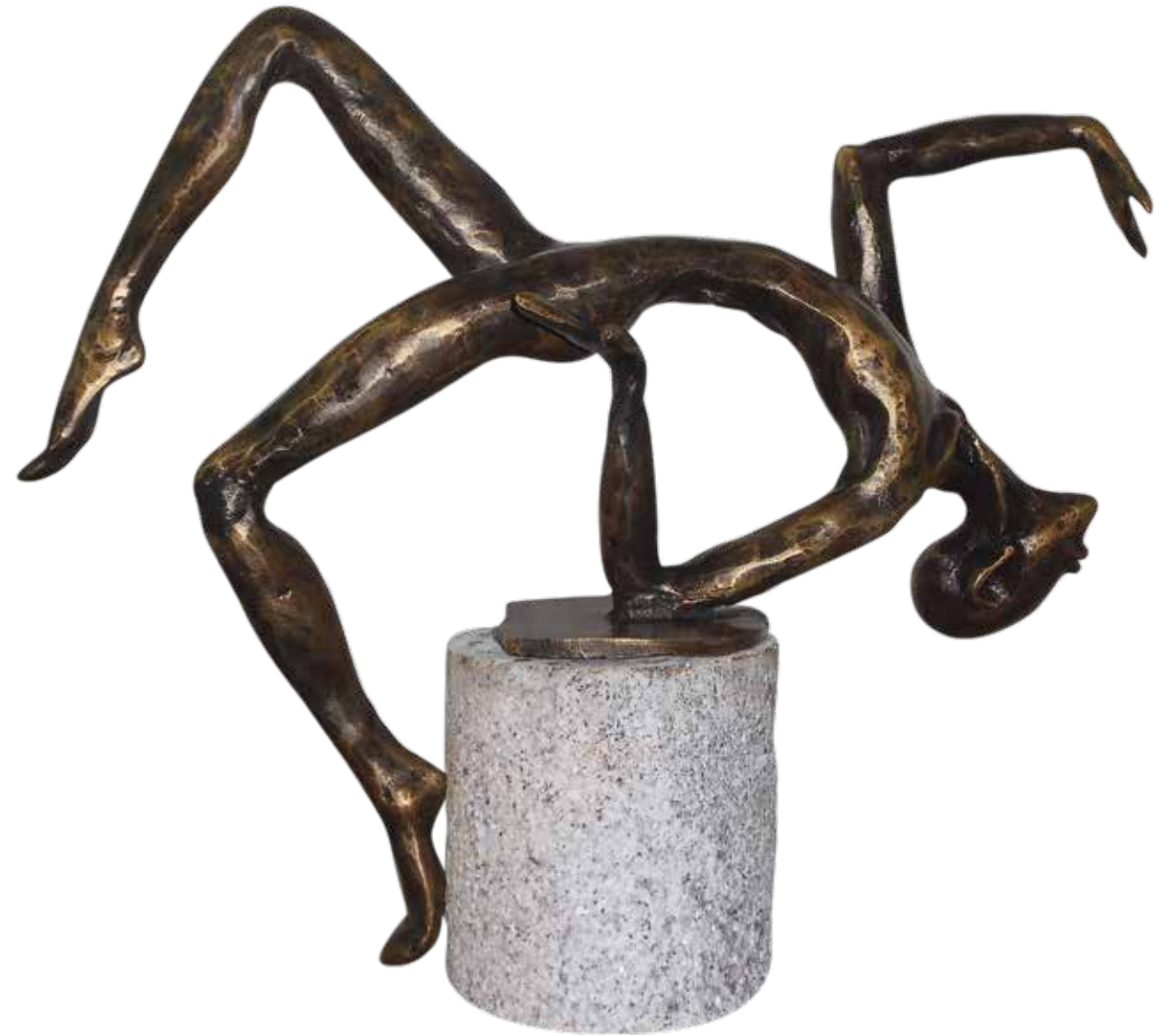
Tumble | 18" x 16" x 6" | bronze on granite