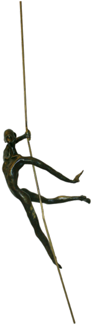
Mobiles (hanging) | rod 66" figure 17" | bronze