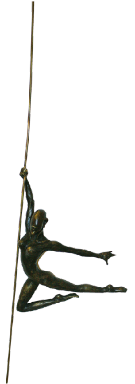
Mobiles (hanging) | rod 57" figure 16" | bronze