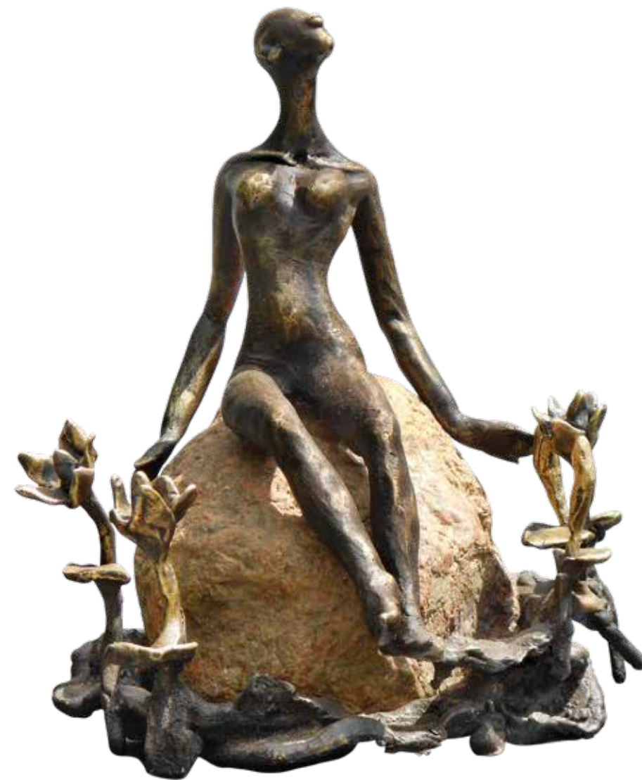
Lotus Pond | 11" x 9" x 12" | bronze on granite