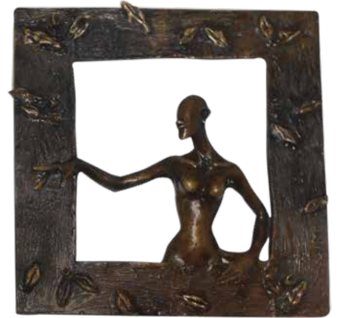
Looking Out | 15" x 15" each | bronze