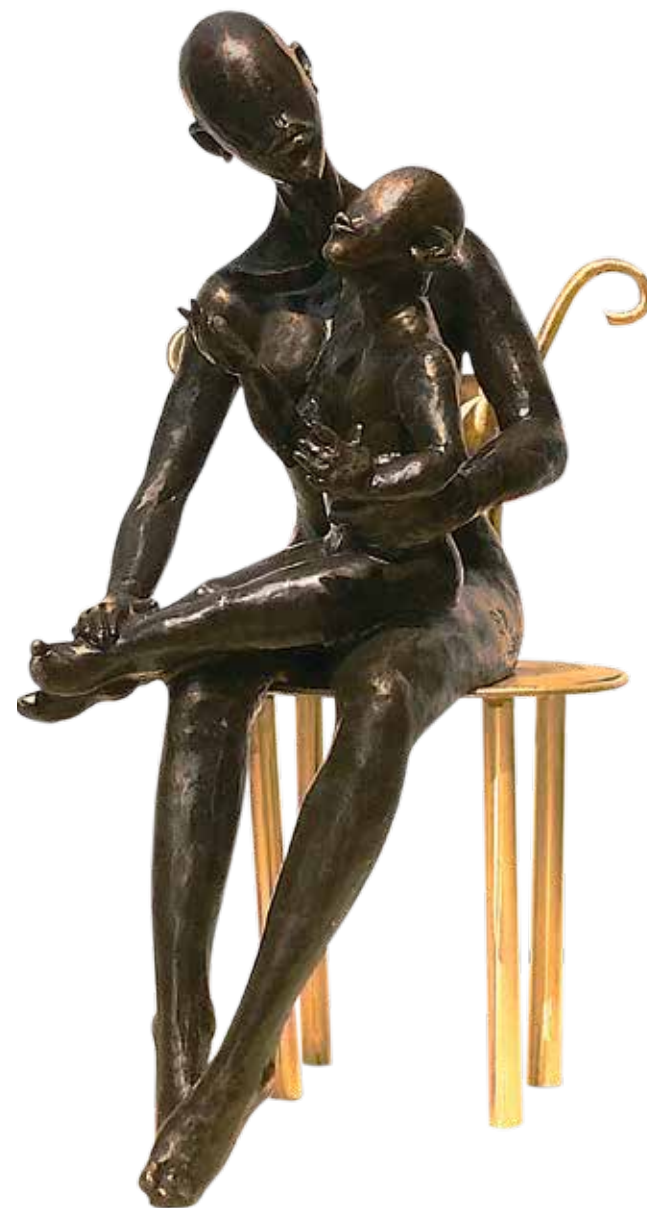
Mother and Child | 42" x 28" x 17" | bronze