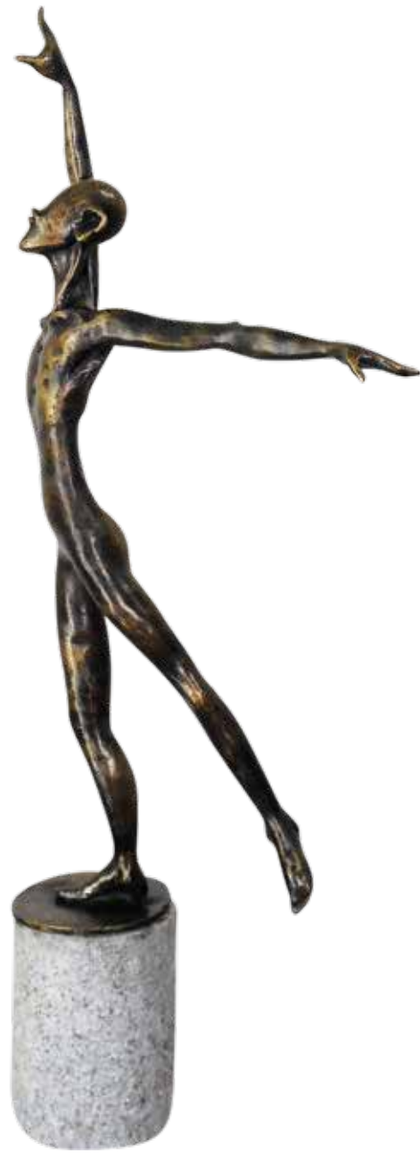
Reaching Out | 33 x 12 x 6 | bronze on granite