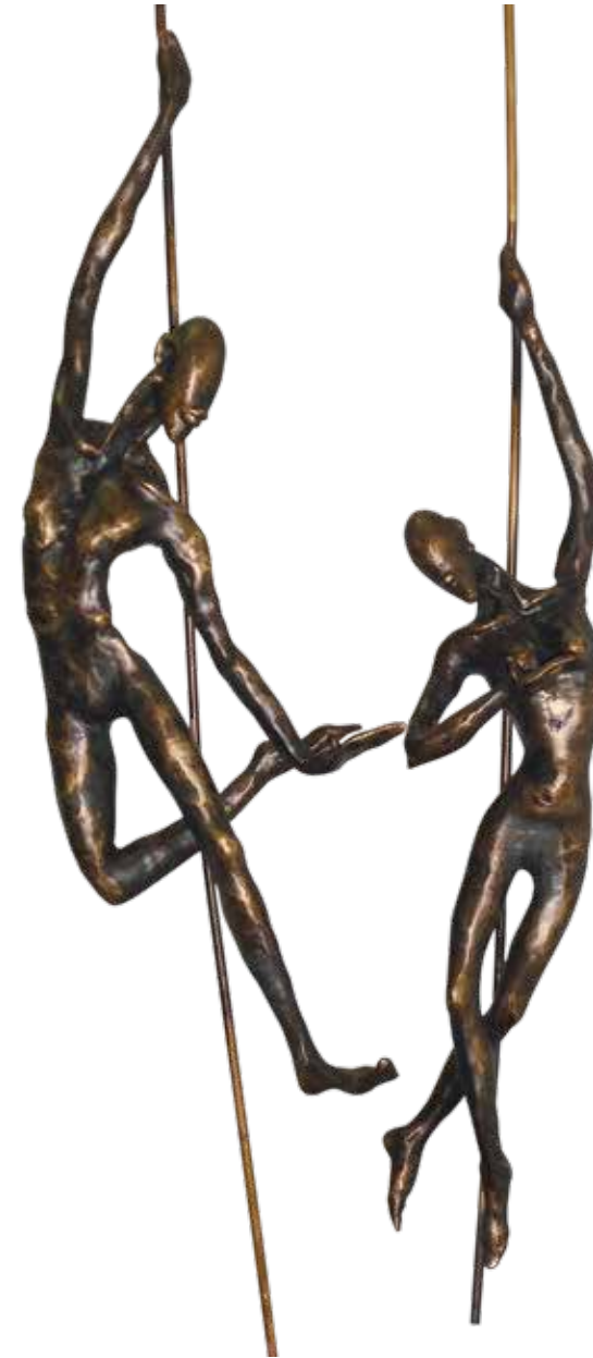
Mobiles (hanging) | rod 58" figure 20" each | bronze