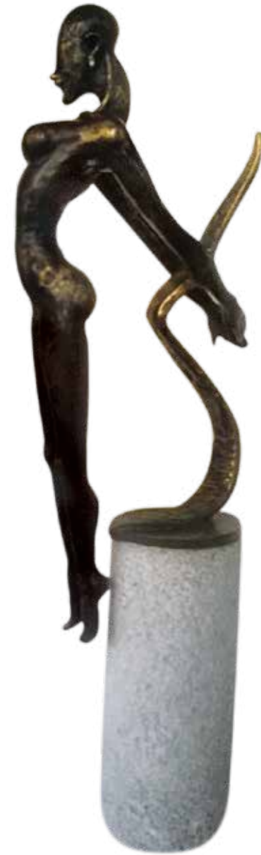
Jump | 58" x 15" x 8" | bronze on granite