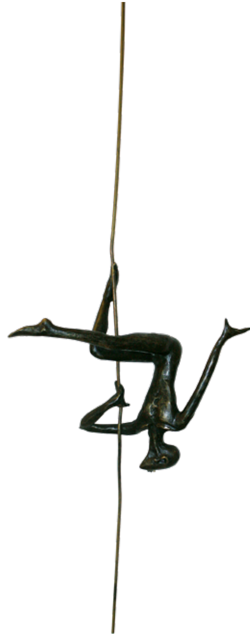
Mobiles (hanging) | rod 49" figure 14" | bronze