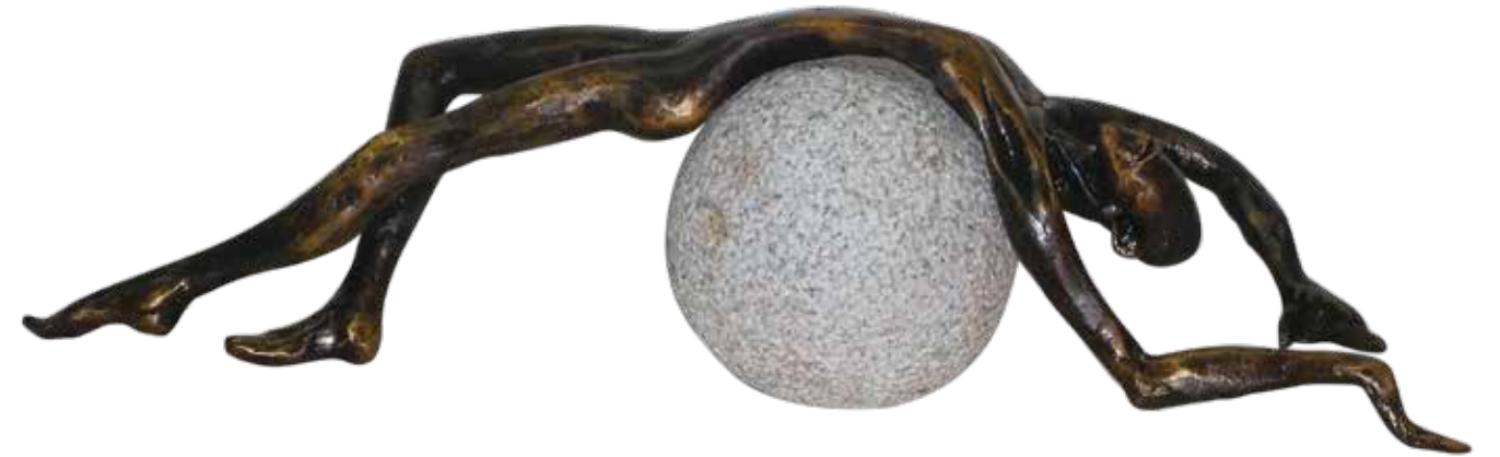
Still on the Ball | 24" x 8" x 7" | bronze on granite